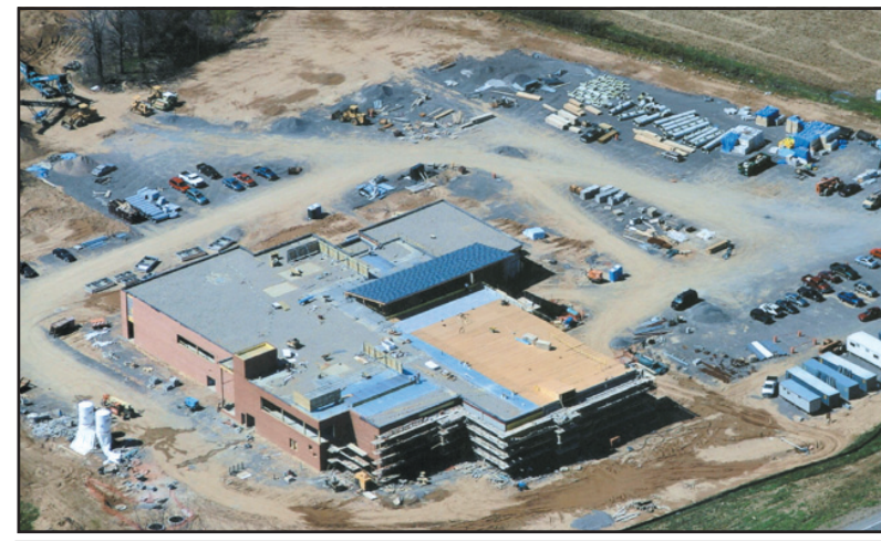
Aerial view of the construction of the Eastside YMCA, Penfield

Market research determined that the Rte. 441 corridor, near Rte. 250, would be an ideal location for the Eastside YMCA. Passero Associates assisted the Y in acquiring the land, with the consent of the town. The new Y is situated on over 50 acres, giving the facility room for outdoor programs, a future outdoor aquatic center and a possible day camp.